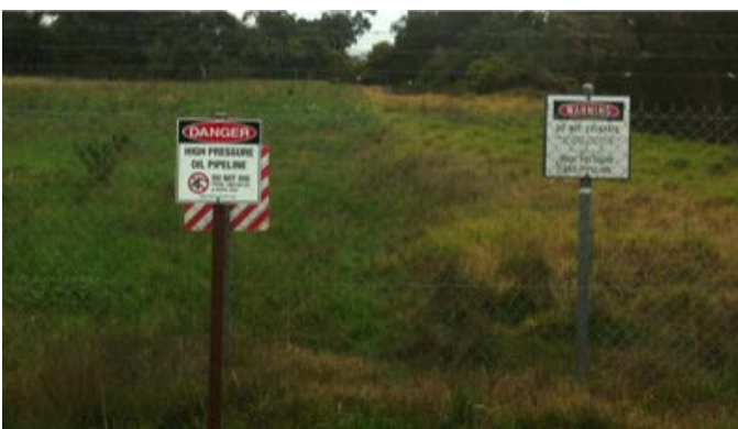
Pipeline easement marked by warning signs.

Pipeline warning signs are strategically placed along the pipeline route within the vicinity of the pipeline to warn the community that there are pipelines in the area. They do not give the exact location of the pipeline.