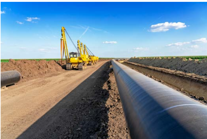
Pipeline maintenance works.

If you plan on undertaking any of these activities, please contact "Dial Before You Dig" immediately. If you have any questions, please contact Viva Energy.