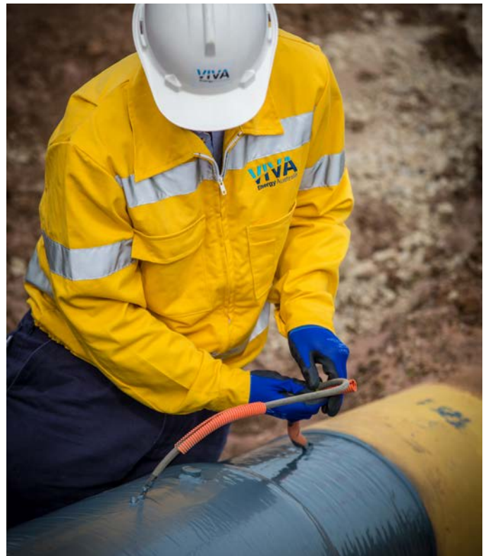
Maintenance works being carried out on a pipeline.