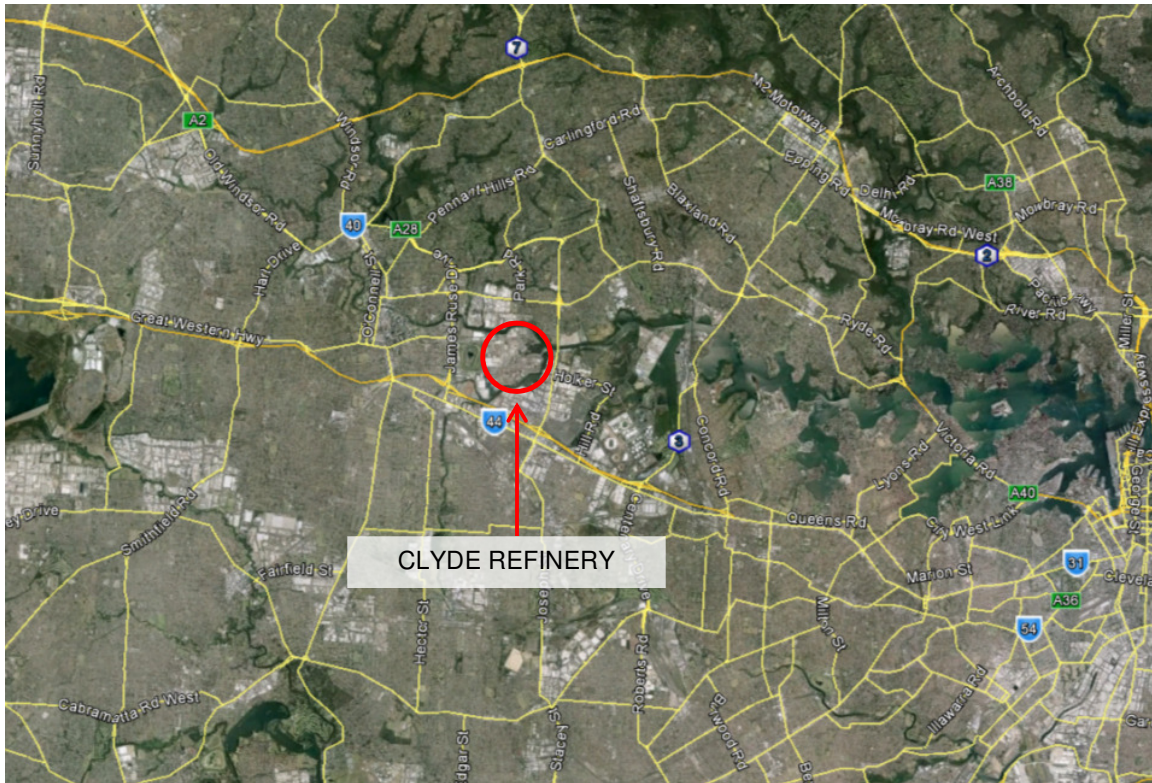
Figure 1 - Location of Clyde Refinery

The Clyde Refinery is located in Clyde, New South Wales, Australia, approximately 16km west of the Sydney Central Business District.