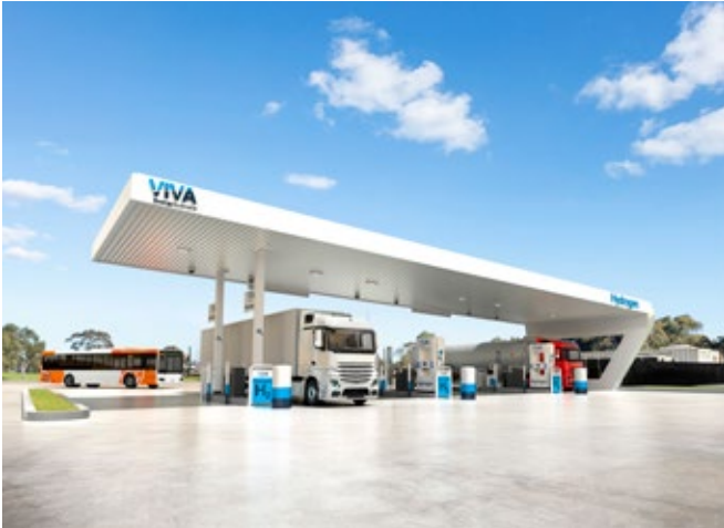
Artist's depiction of the New Energies Service Station, preliminary, conceptual and not to scale

The New Energies Service Station will be Australia's first publicly accessible service station that offers hydrogen refuelling and electric vehicle recharging for heavy fuel cell electric vehicles (FCEVs). To achieve this, Viva Energy has brought together a range of stakeholders including vehicle operators and government to develop a hydrogen mobility project involving the deployment of infrastructure (service station) and commercial vehicles to demonstrate the important role hydrogen can play in decarbonising heavy vehicle transport. For more information about the project please visit www.vivaenergy.com.au/energy-hub/new-energies-service-station-project